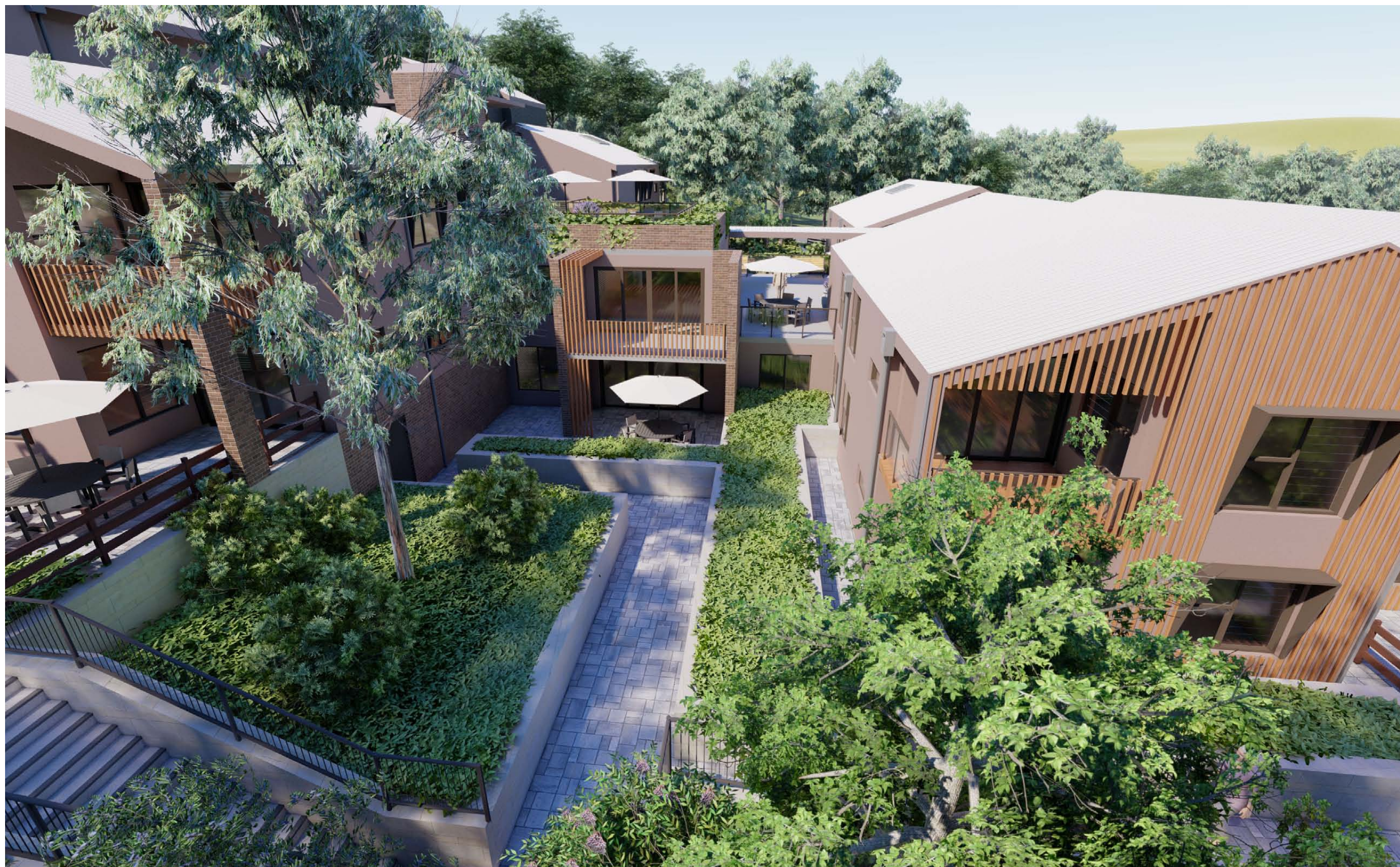
Northern Side Passage Walkway and Revegetation Buffer between the ILUs & Adjoining Property