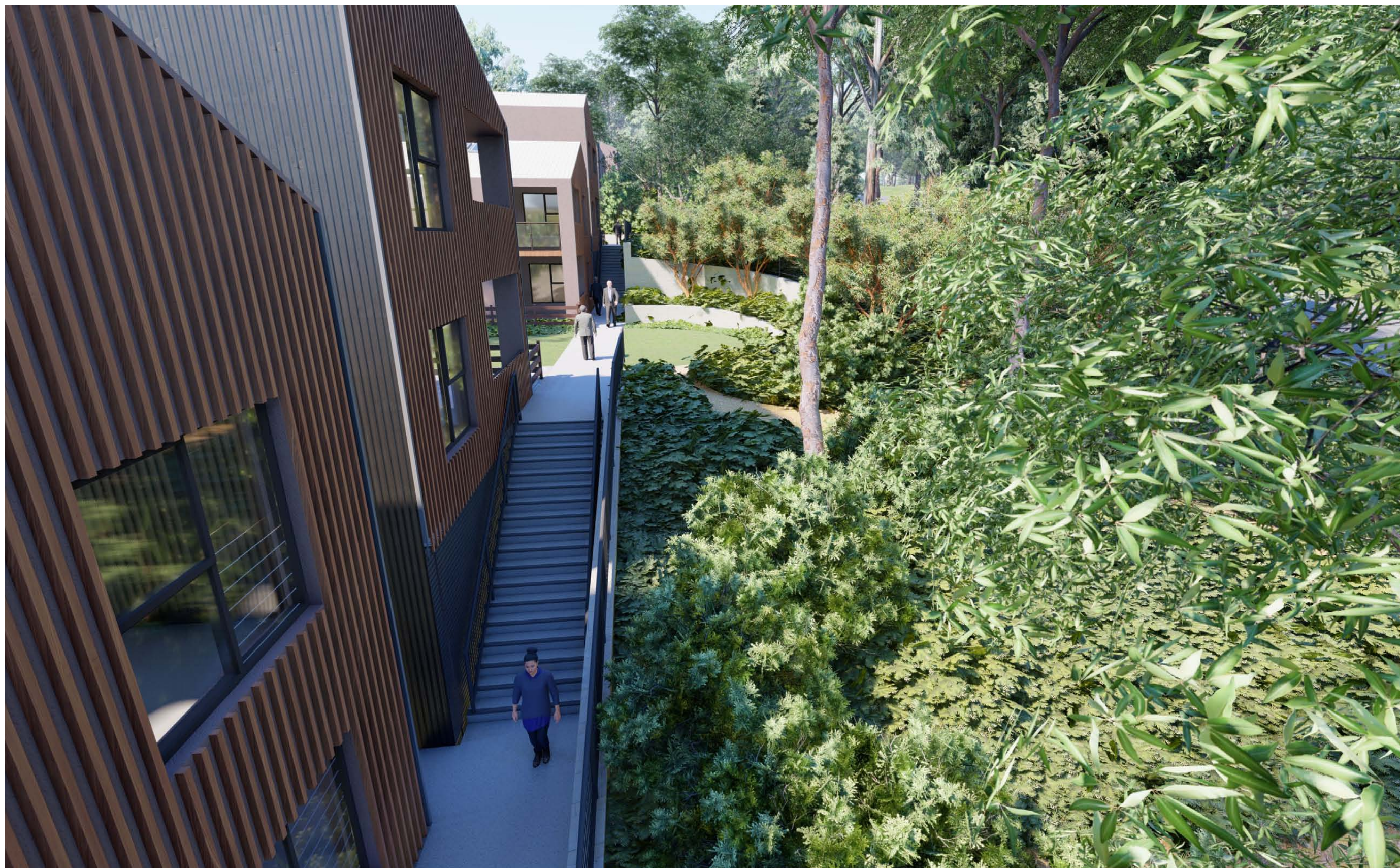
Southern Side Passage Walkway and Revegetation Buffer between the ILUs & Cooyong Rd