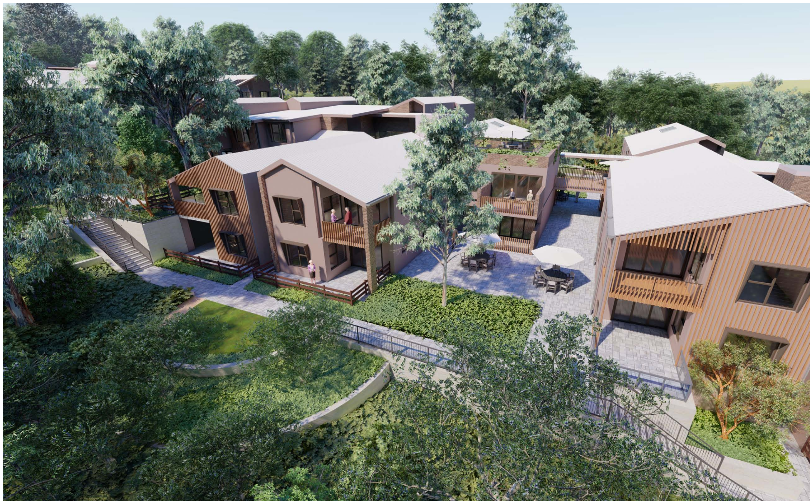
Side Passage and Courtyards to North of the ILUs