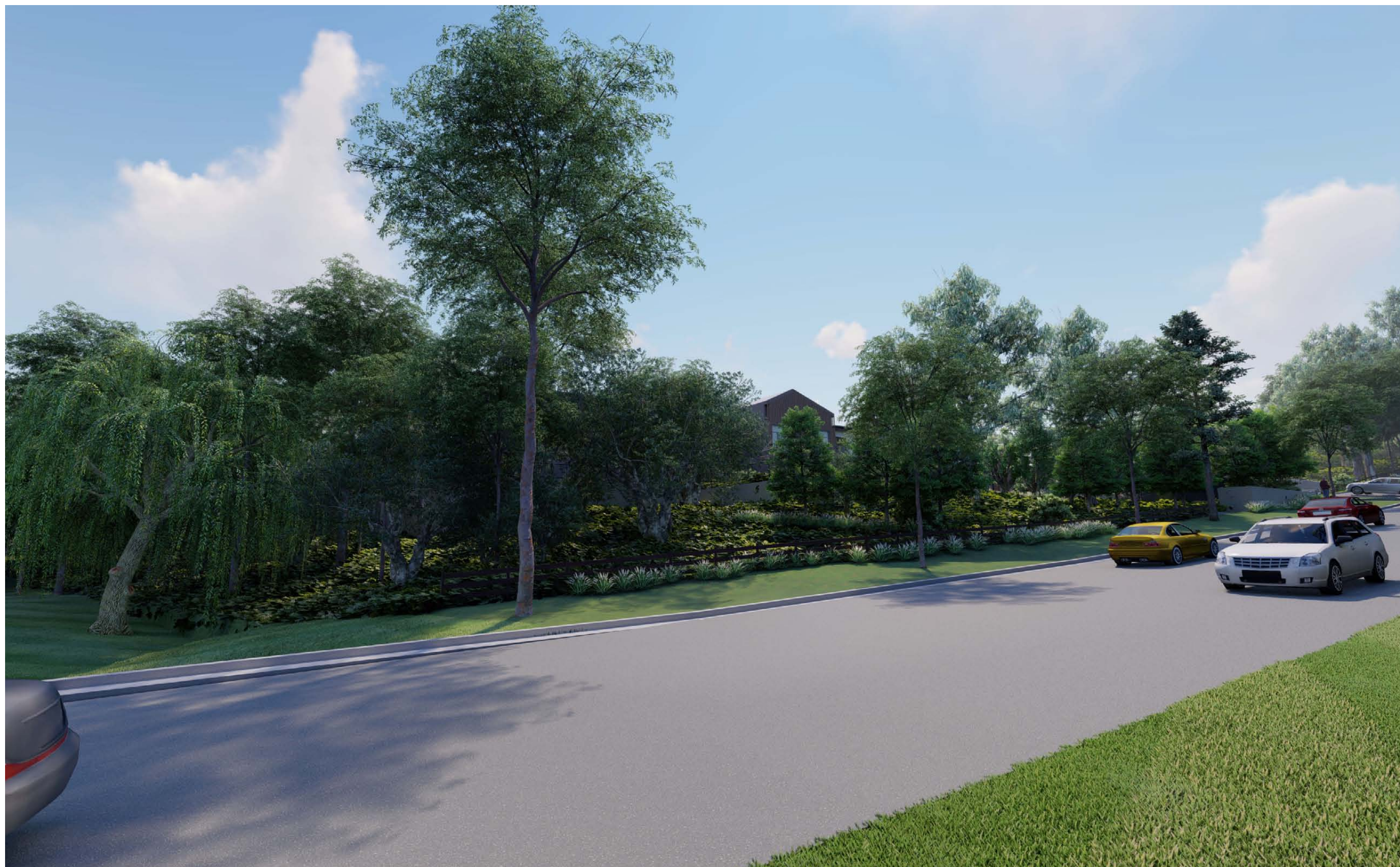
View to RACF from Cooyong Road at SW Corner of Site