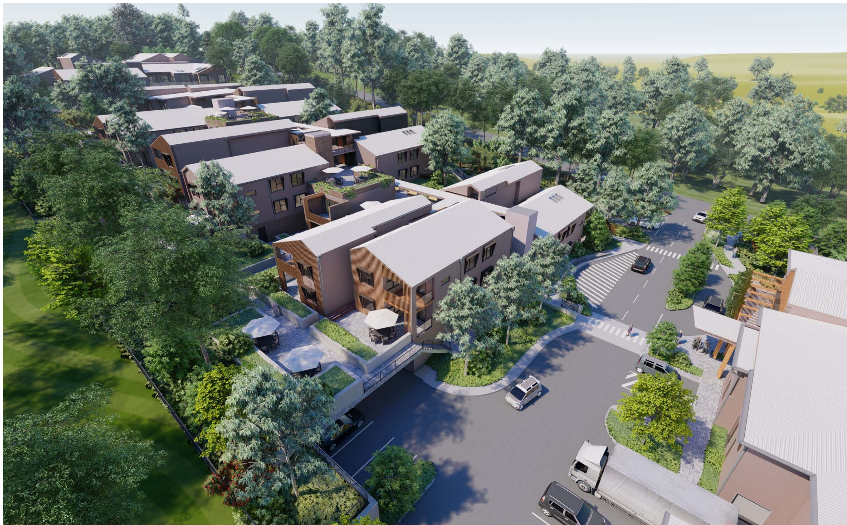
Overview - Looking South East Over ILUs