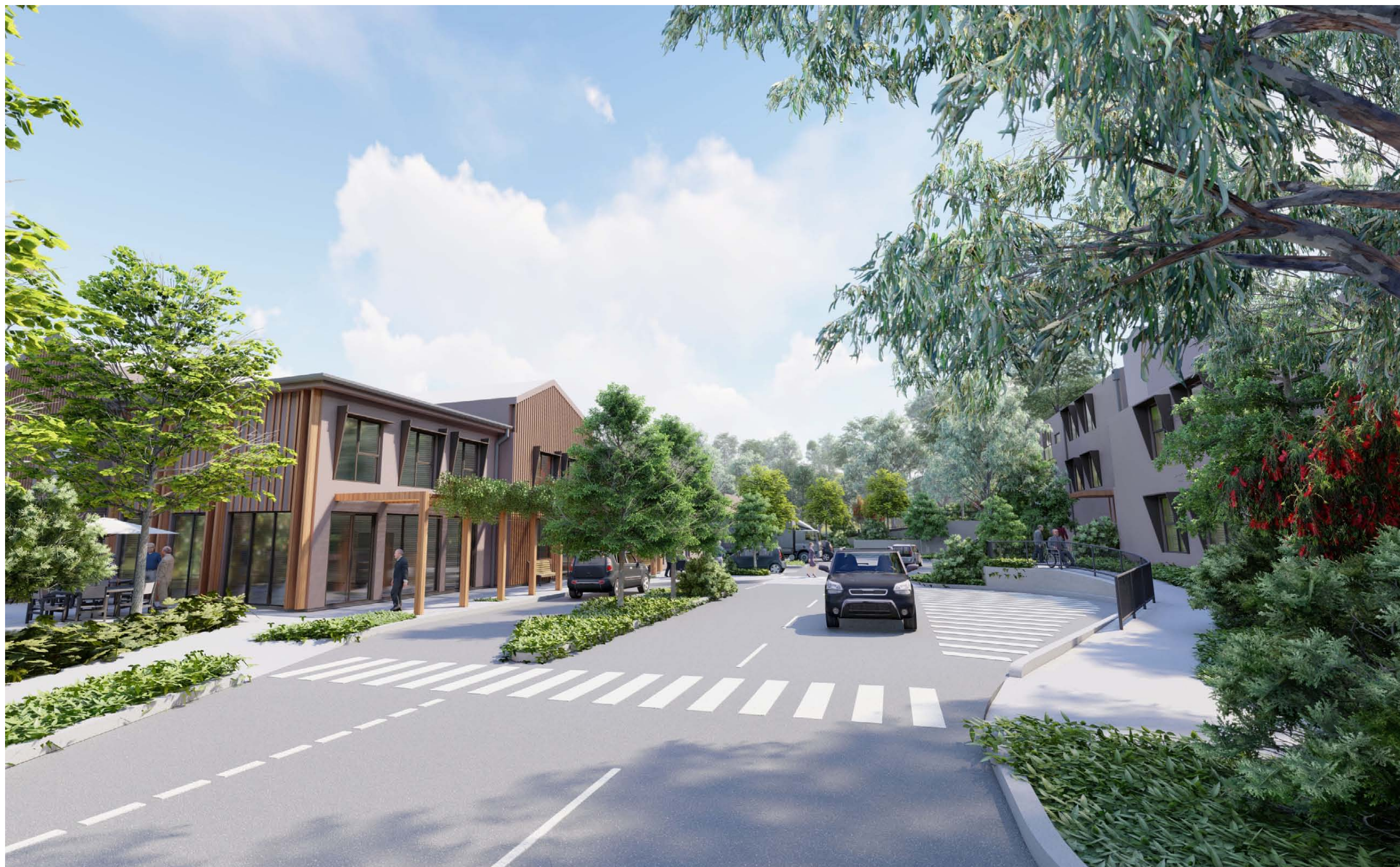
View to RACF Entry Drop off Zone from Internal Driveway