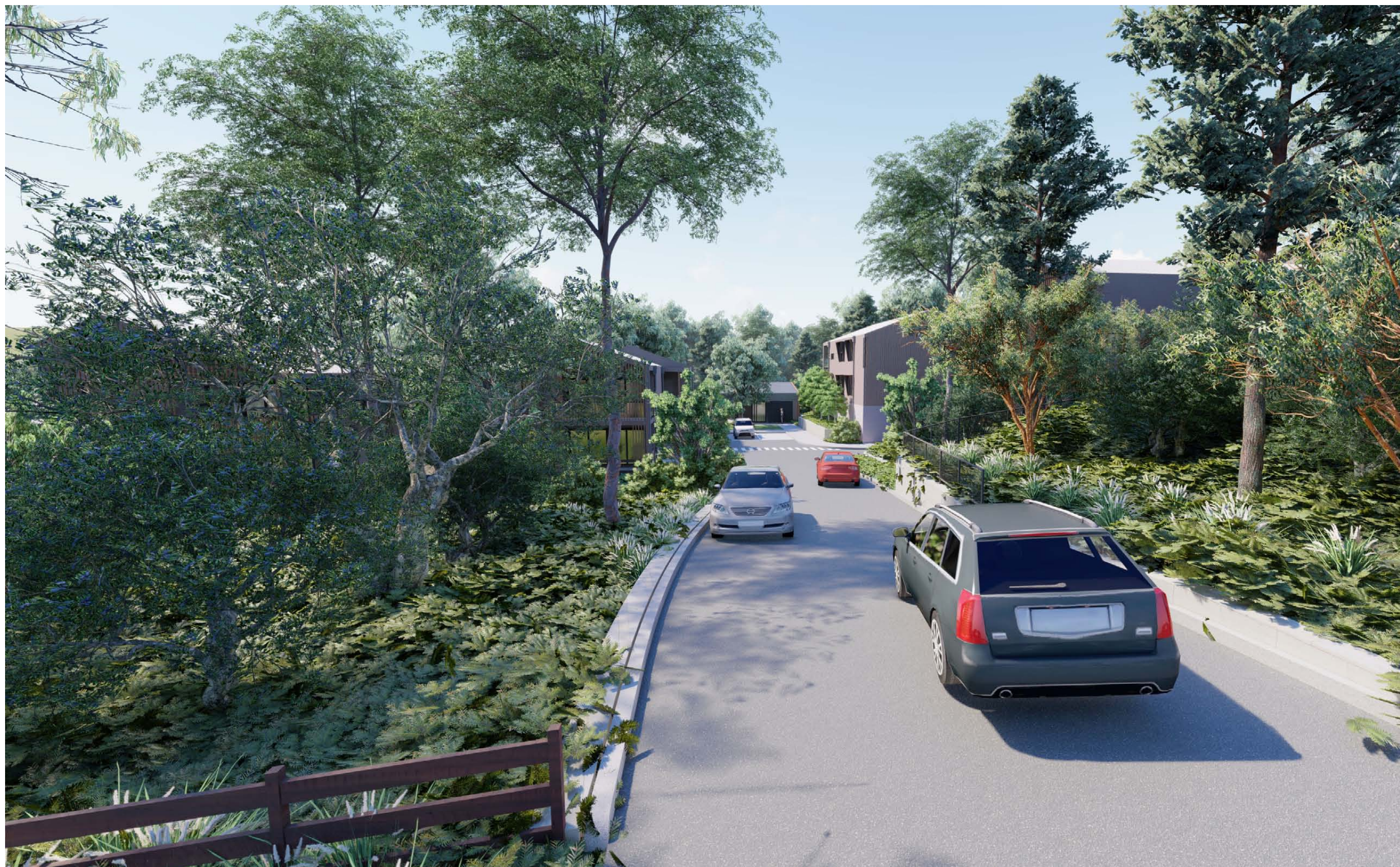
Eastern Driveway Entry to ILUs