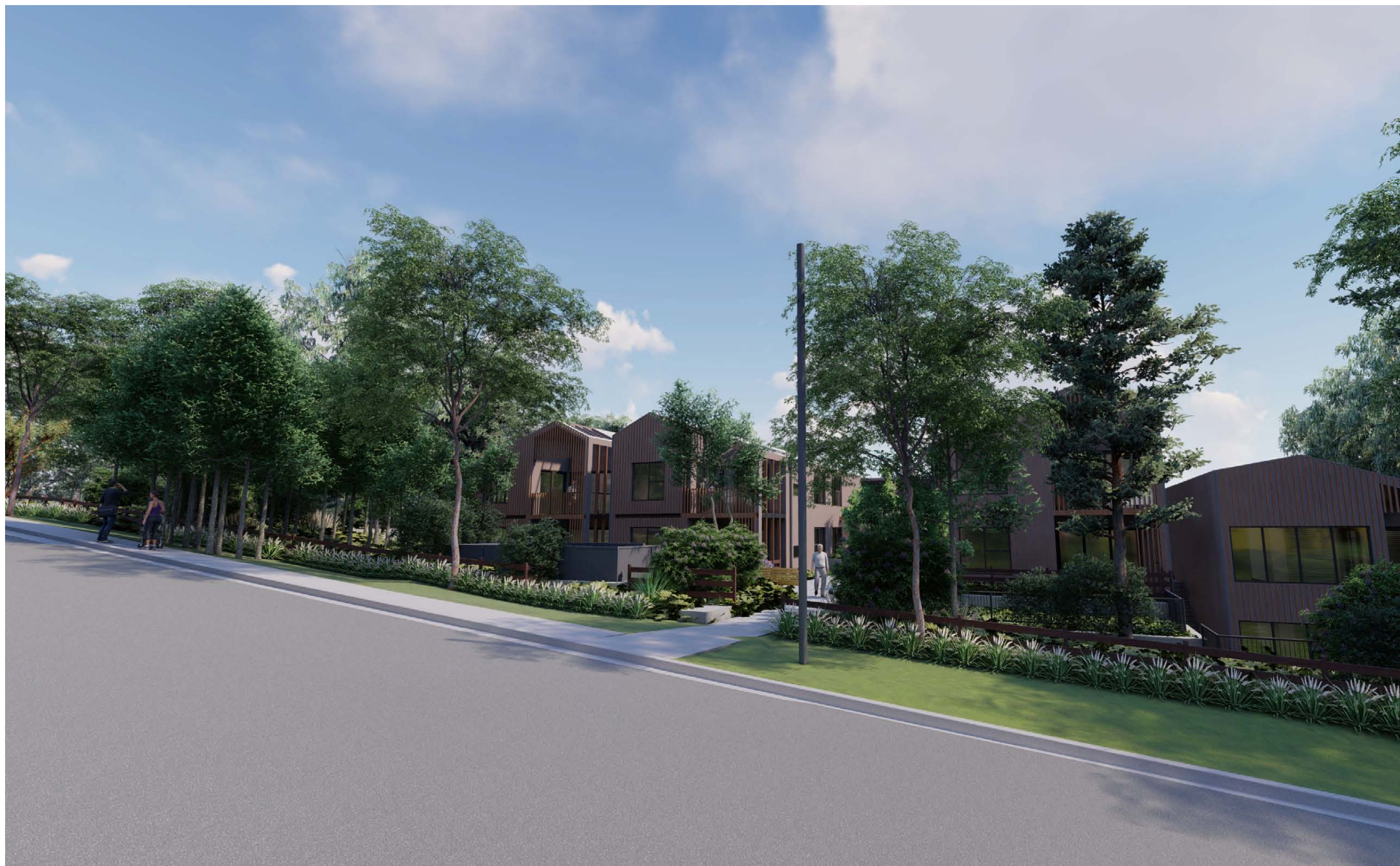
Laitoki Road Eastern Elevation and Pedestrian Connection