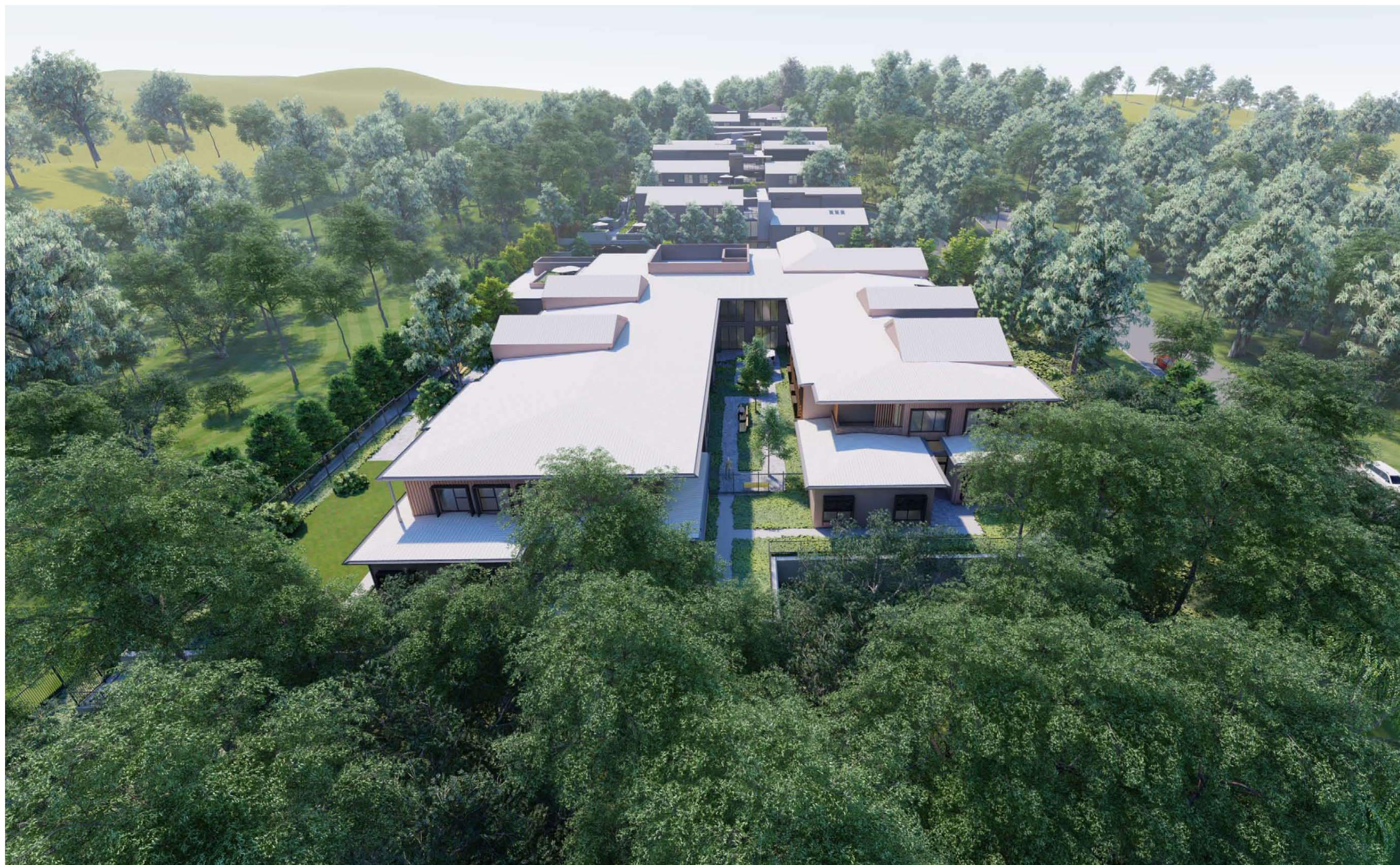
Overview - Looking North East with the RACF in the Foreground and the ILUs Beyond