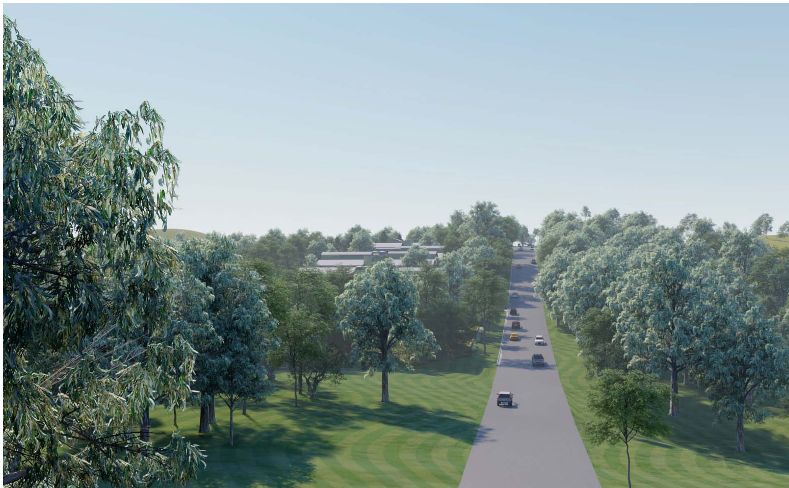
View along Cooyong Road frontage from approximate elevation and vantage point of the western ridgeline to west of site