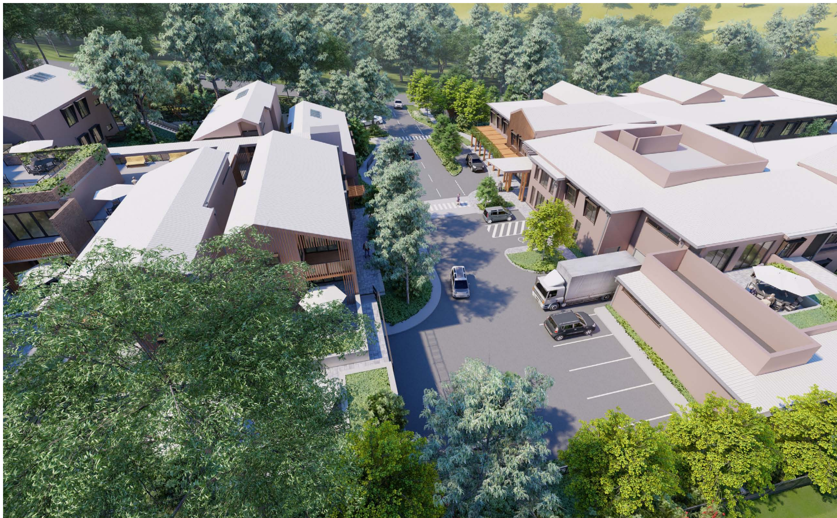
Overview - Entry to the RACF and the Lower ILUs