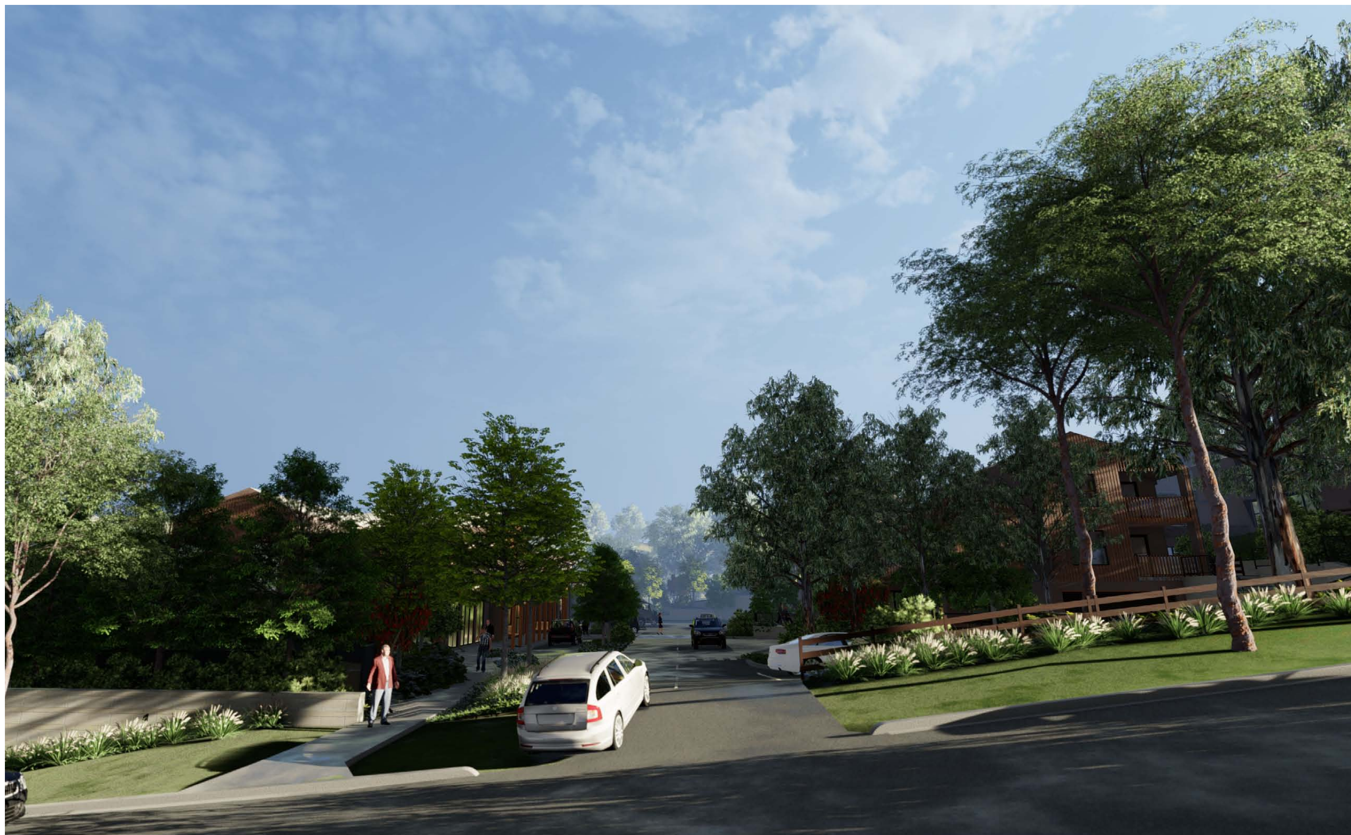
Western Driveway Entry to the RACF and the Western ILUs off Cooyong Road