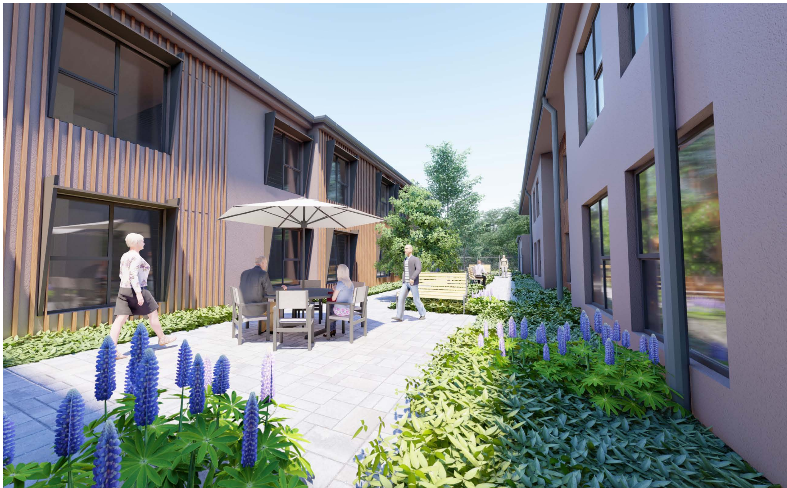
RACF Central Secure - Dementia Courtyard