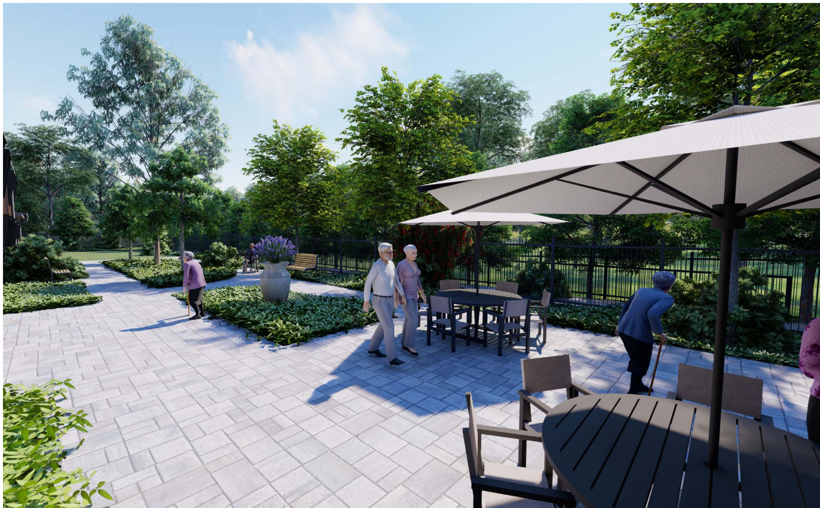
RACF Northern Courtyard