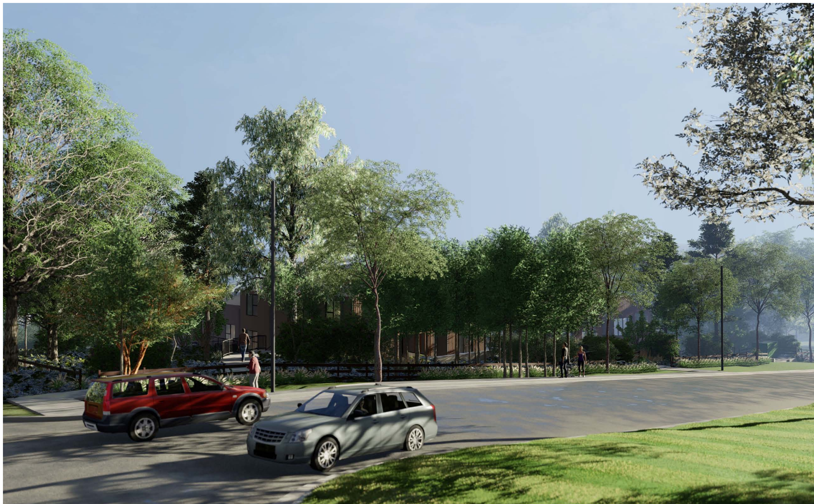
Detailed eye-level view along Laitoki Road frontage from the intersection with Cooyong Road looking north-west